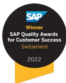
PROJECT SWISS RE